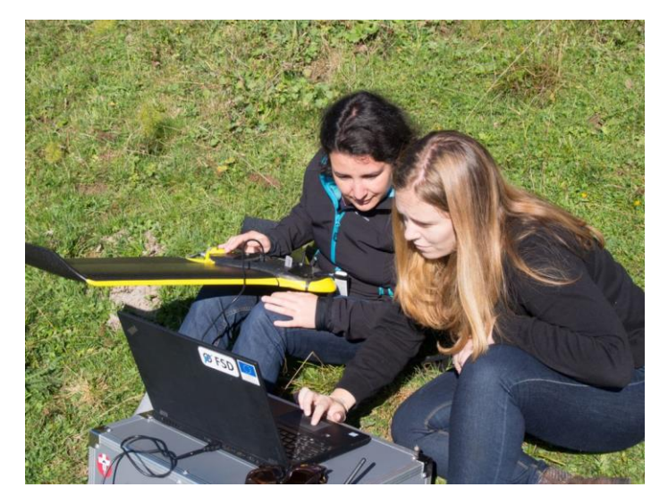
Figure 3 - CartONG staff looking at data that has just been collected by FSD's eBee drone.

Fortunately, the weather cleared up on the day of the simulation itself, which enabled the CartONG team to complete the flights at the last minute.