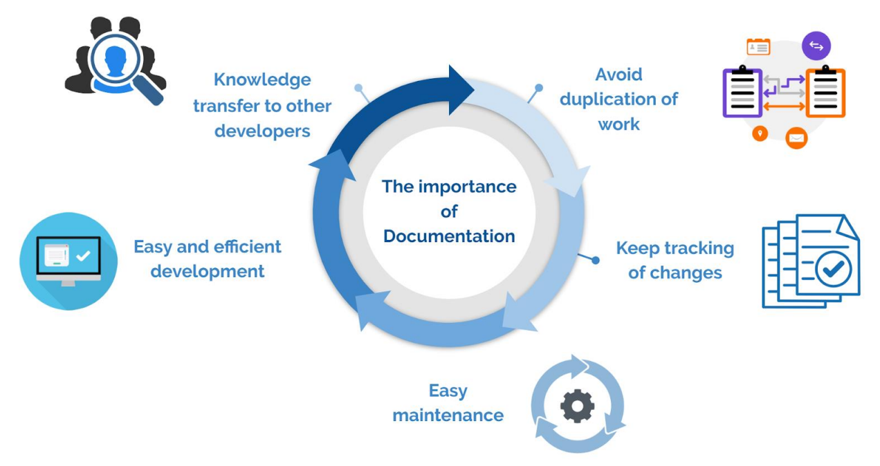
A screenshot illustrating the importance of system documentation

The presence of documentation helps keeping track of all aspects of a system and improves its quality over time. Its main focus is easy and efficient development, as well as maintenance and knowledge transfer to other developers. Successful documentation will make information easily accessible, helps to avoid duplication of work, simplify the product and to cut support costs.